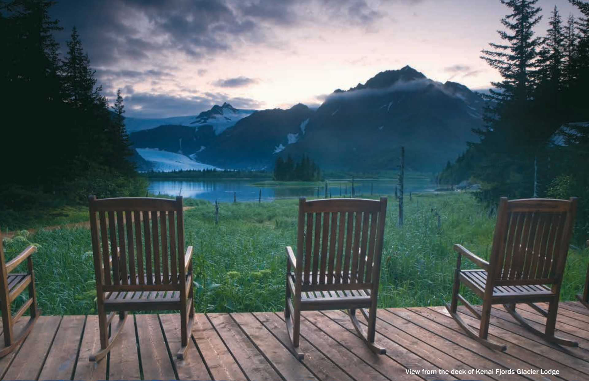
View from the deck of Kenai Fjords Glacier Lodge